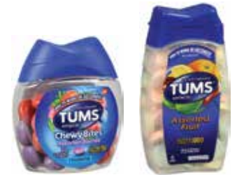
Additional select Tums items where available

Antacid Chewy Bites, 32 ct or Chewable Tablets, 72 ct