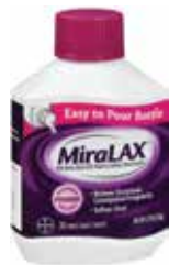
Additional select MiraLAX item where available

Powder Relieves Occasional Constipation/Irregularity 30 Once-Daily Doses 17.9 oz