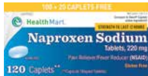
At participating stores while supplies last

Health Mart BONUS NAPROXEN SODIUM 220 mg, Pain Reliever/ Fever Reducer (NSAID) Caplets, 100 + 20 ct