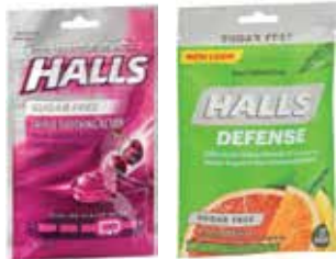
Additional select Halls items where available

Sugar Free Menthol - Cough Suppressant/ Oral Anesthetic Drops, 25 ct